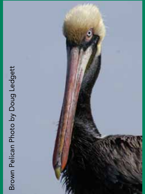
Brown Pelican