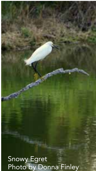
Snowy Egret